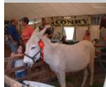
Colleen first at Yealmpton show