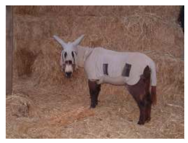
Copper in her Snuggyhood

Copper , Roy and Beamish all have special rugs, which they wear from dusk until dawn (when the midges/insect are at their worst). They are also dosed daily with a topical solution called benzyl benzoate. Bracken has the same treatment, but does not have a rug as he ripped his to bits in one night and when each rug cost over £120 it was decided try something different, so he has a special feed supplement which had excellent result last year.