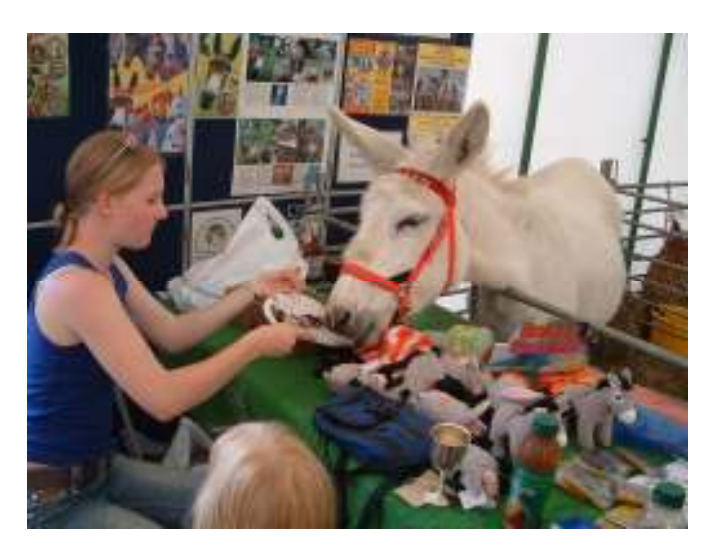
See I told you they do!