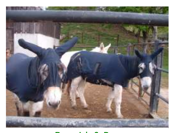
Beamish & Roy