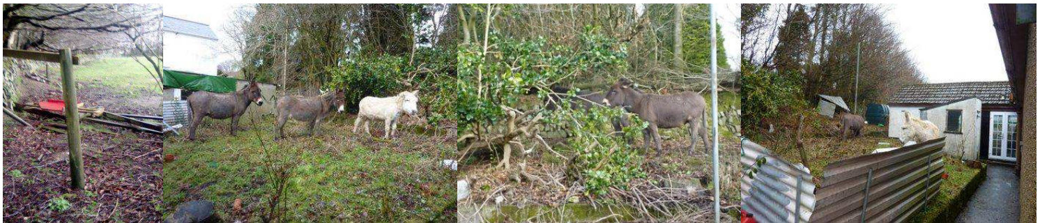
As Old D was busy building the toilets & café bar we knocked down the fence to get into his back garden to do some gardening for him!

Tamar Donkey Sanctuary St. Ann's Chapel Gunnislake Cornwall PL18 9HW Tel: 01822 834072 info@donkeypark.com www.donkeypark.com Charity No 1138221