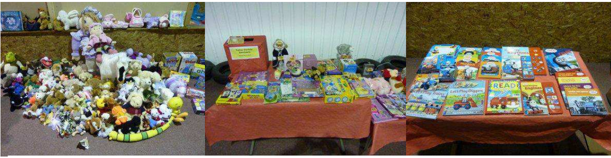
For our charity a lot of toys and books were donated to raise funds at our Christmas fare