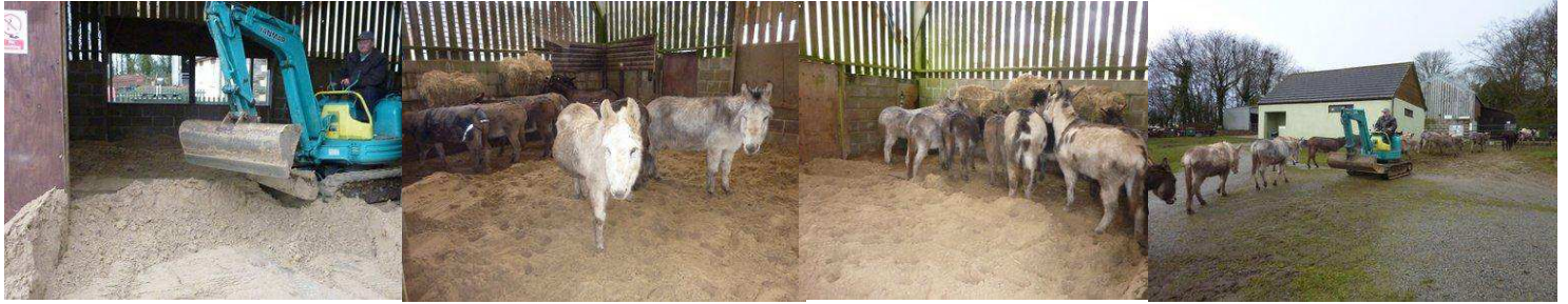
We love the "sea" sand on our donkey house floor that's new every few months