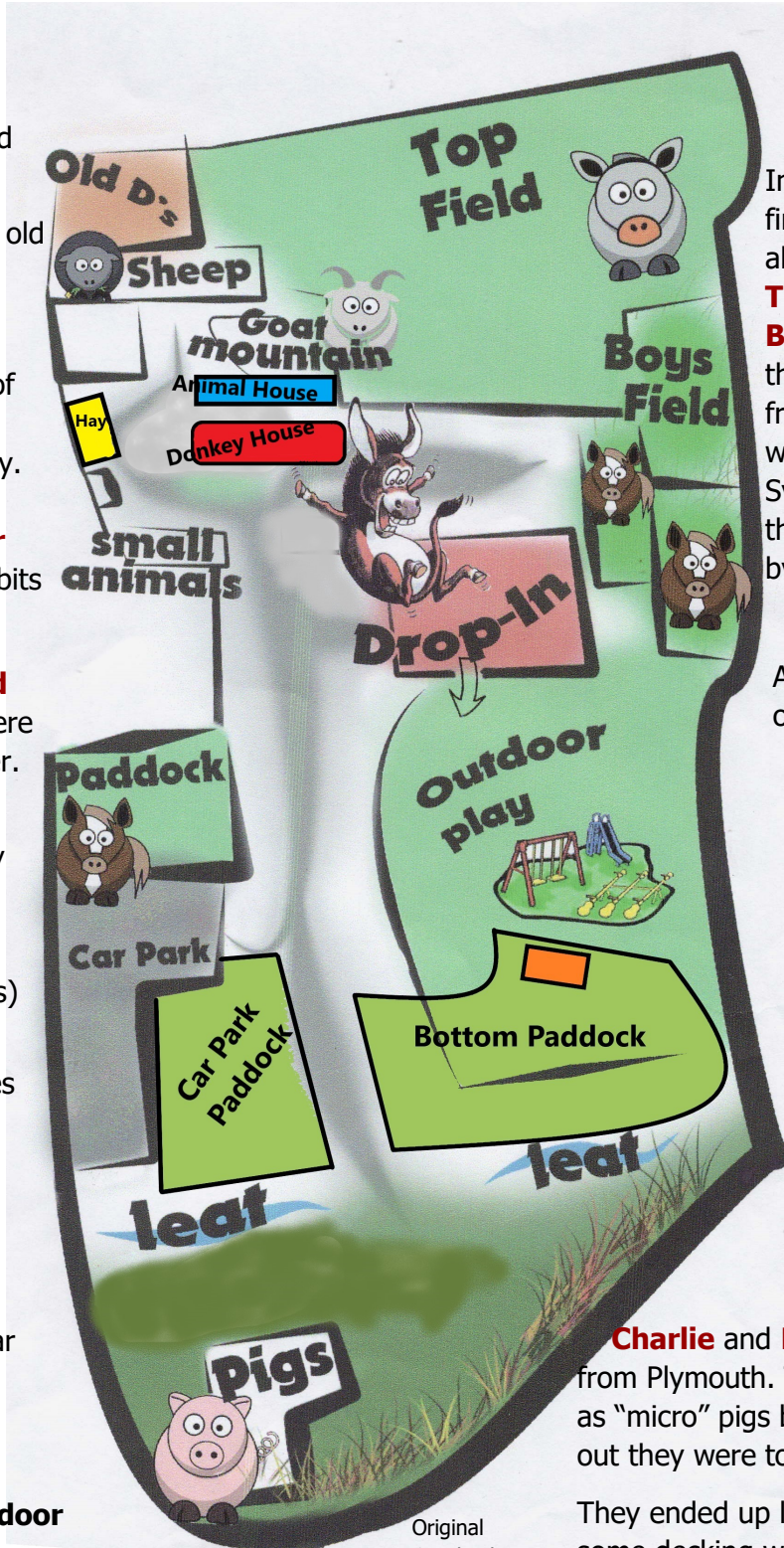
Original Graphic by Jenni Ball

Through access to out-door play area and woods