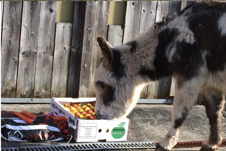
Daphne never misses anything