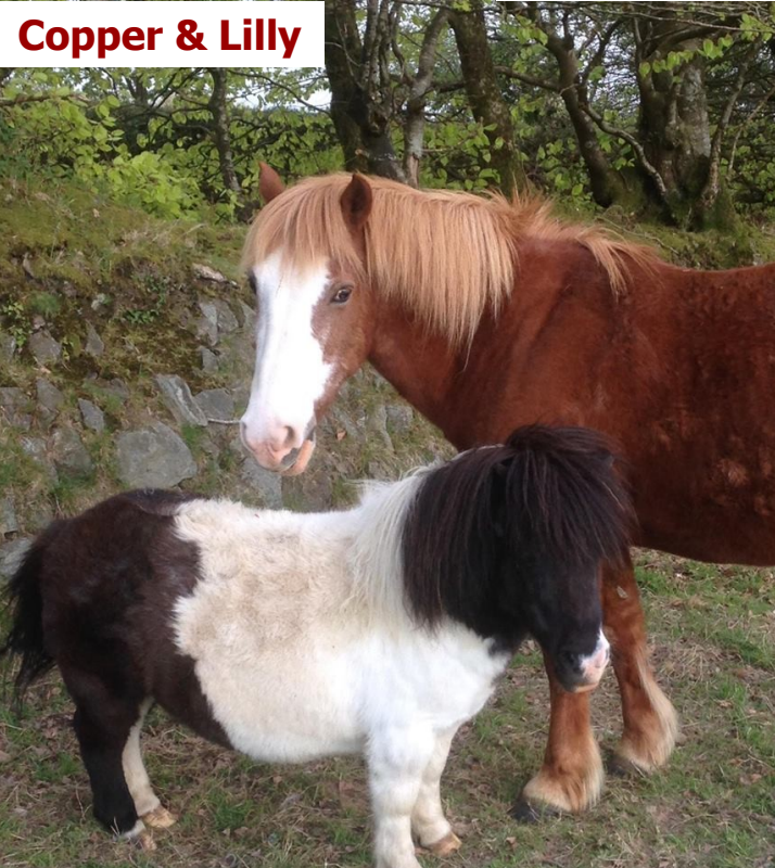
Copper & Lilly