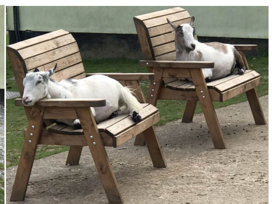
Loaf & Hovis